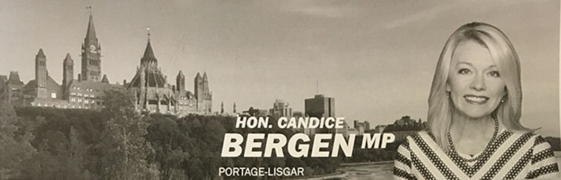
HON. CANDICE BERGEN MP PORTAGE-LISGAR

Dear Constituents, It has been a busy summer in Portage-Lisgar, and I have had the great pleasure of crisscrossing the riding to meet with many of you and listen to your thoughts, concerns and insights. Summer is always one of my favourite times of year, and with so many wonderful events like Corn and Apple, the Manitoba Stampede, and the Portage Potato Festival right in our own backyard, it's easy to understand why.